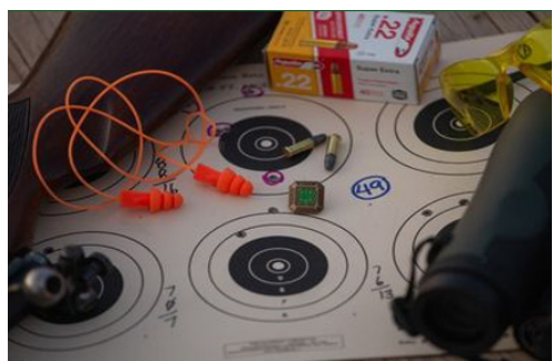
"Shooting Sports" Breanne Lucero, Socorro 4-H Category