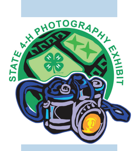
Click here at https://nm4h.nmsu. edu/4h/photocontest.html to find the 2022 Photography Contest Slide Show to see 1st, 2nd and 3rd Place winners.