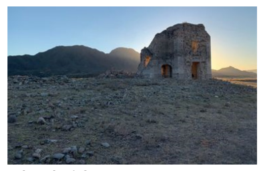
"Church Lights" Payton Moore, Otero Landscape Category